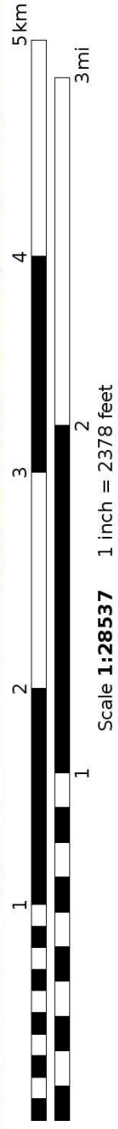
Emmaline Lake: 4