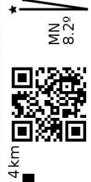
North Fork: 3