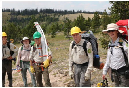
PWV Trail Members

Anyone and everyone in PWV can clear almost any tree from the trail as long as they are comfortable doing so and it is safe for them to do.